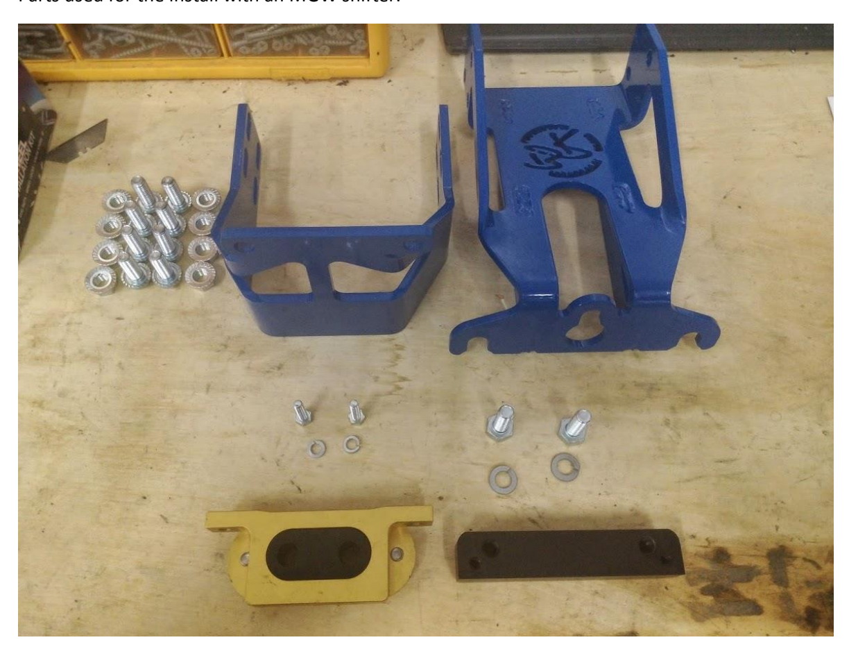
With the MGW you will reuse the two post bracket. Attach the two post bracket to the Blowfish adapter bracket.

Parts used for the install with an MGW shifter.